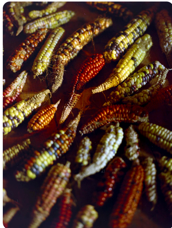
Leon Haas, »peak of an iceberg« (2023/2024)