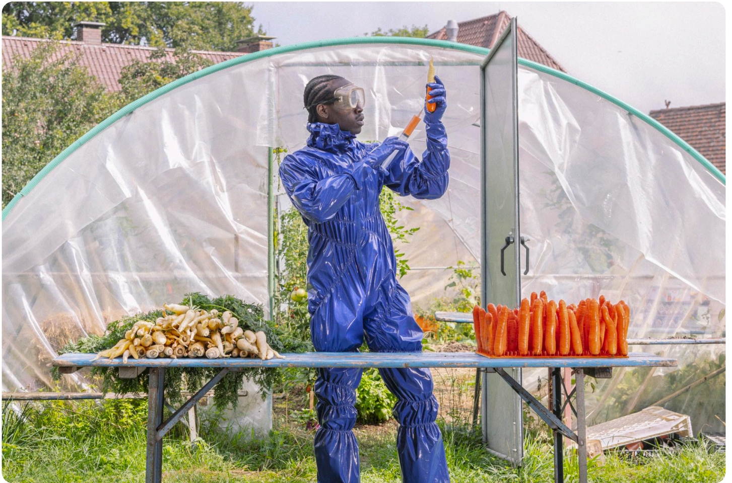
Max Kühn, What we like

Ten years later, in 1972, the Stockholm Environmental Summit banned the herbicide DDT (immediately after the Second World War, people had been sprayed with it to prevent the spread of epidemics in refugee camps).